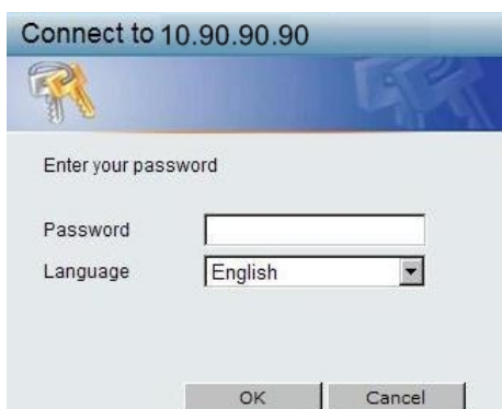
Figure 3.3 – Logon Dialog Box

The switch supports 10 languages including English, Traditional Chinese, Simplified Chinese, German, Spanish, French, Italian, Portuguese, Japanese and Russian. By default, the password is admin and the language is English .